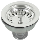
Basket Waste Strainer 15 L/min Rating, Suits 59OI ZZ