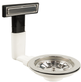
Basketwaste and Rect. Overflow Kit, 15 L/min Rating (HCO)