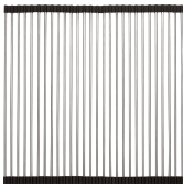
Franke Roller Mat (Suits Bolero, Centinox, Rambla) RM44