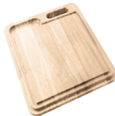
Franke Chopping Board (Suits Bolero) CB93I