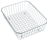
Franke Drainer Basket (Suits Bolero, Centinox, Vela) DB664