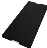
Franke Chopping board (Suits Bolero) CB964