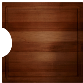
Chopping Board, 351 x 410mm 20.9566.WO