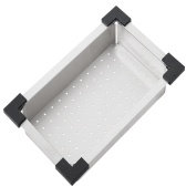
Colander, Stainless Steel 20.9647.SA