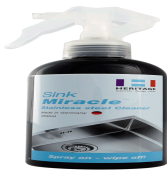
Autosol 3inl for Stainless Steel Cleaner 250ML