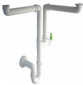
Spazio plumbing Kit Double