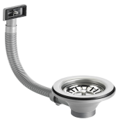
Basketwaste and Overflow, SS, grill type overflow