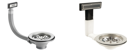
Basket waste and overflow (Alt: 20.9427.ZZ), Texas bowls

Elevate your kitchen with the Texas sink by Archant. Crafted from premium 18-gauge stainless steel, this sink combines classic elegance with modern convenience. Its generous single-bowl design features a durable finish, and easy maintenance. With versatile installation options like Overmount and Undermount the Texas sink effortlessly enhances your kitchen's functionality and style.