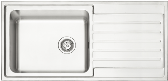
20.9688.SA Texas 1000-10, Satin

Elevate your kitchen with the Texas sink by Archant. Crafted from premium 18-gauge stainless steel, this sink combines classic elegance with modern convenience. Its generous single-bowl design features a durable finish, and easy maintenance. With versatile installation options like Overmount and Undermount the Texas sink effortlessly enhances your kitchen's functionality and style.