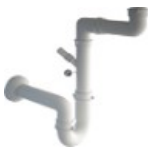
Spazio plumbing Kit Single