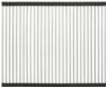
Hot Mat, Stainless Steel